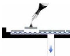
VR Tray in Vacuum Release Mode