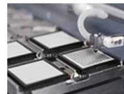
VR Tray on Automated Pick and Place