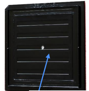
Tacky Vertec strips hold device in place