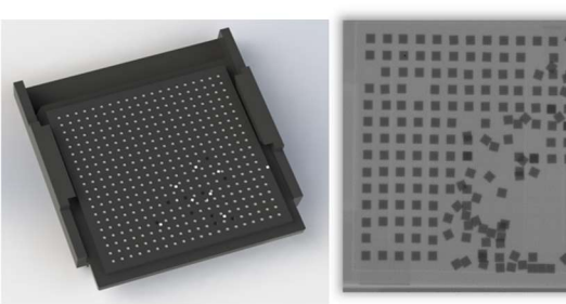
Die Migrated out of Waffle Pack

Shipping today's thin die (<250µm) in industry standard waffle packs presents a challenge for many semiconductor manufacturers. Thin devices packaged in these chip trays have a tendency to migrate